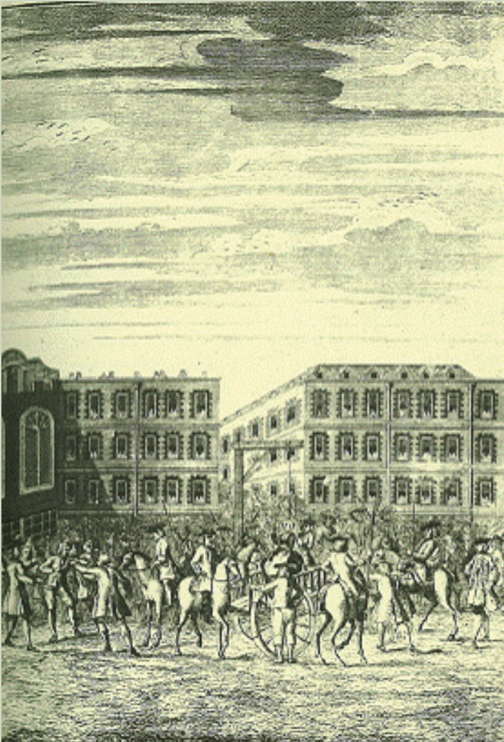
The execution of Sarah Malcolm in Fleet Street

It can scarcely be imagined nowadays that the peaceful haven of the Temple was the scene of one of the most notorious crimes of the eighteenth century. The area now known as Church Court contained the old Lamb Building in its centre, and was divided into Lamb Building Court at the western end (where the Millennium Column now stands) and Tanfield Court to the east. A number of sets of chambers stood in Tanfield Court (on the site now occupied by the Inner Temple Library and Francis Taylor Building) and in number 3, on the top floor, lived an elderly widow named Lydia Duncomb.