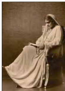
Cornelia Sorabji (1866-1954)