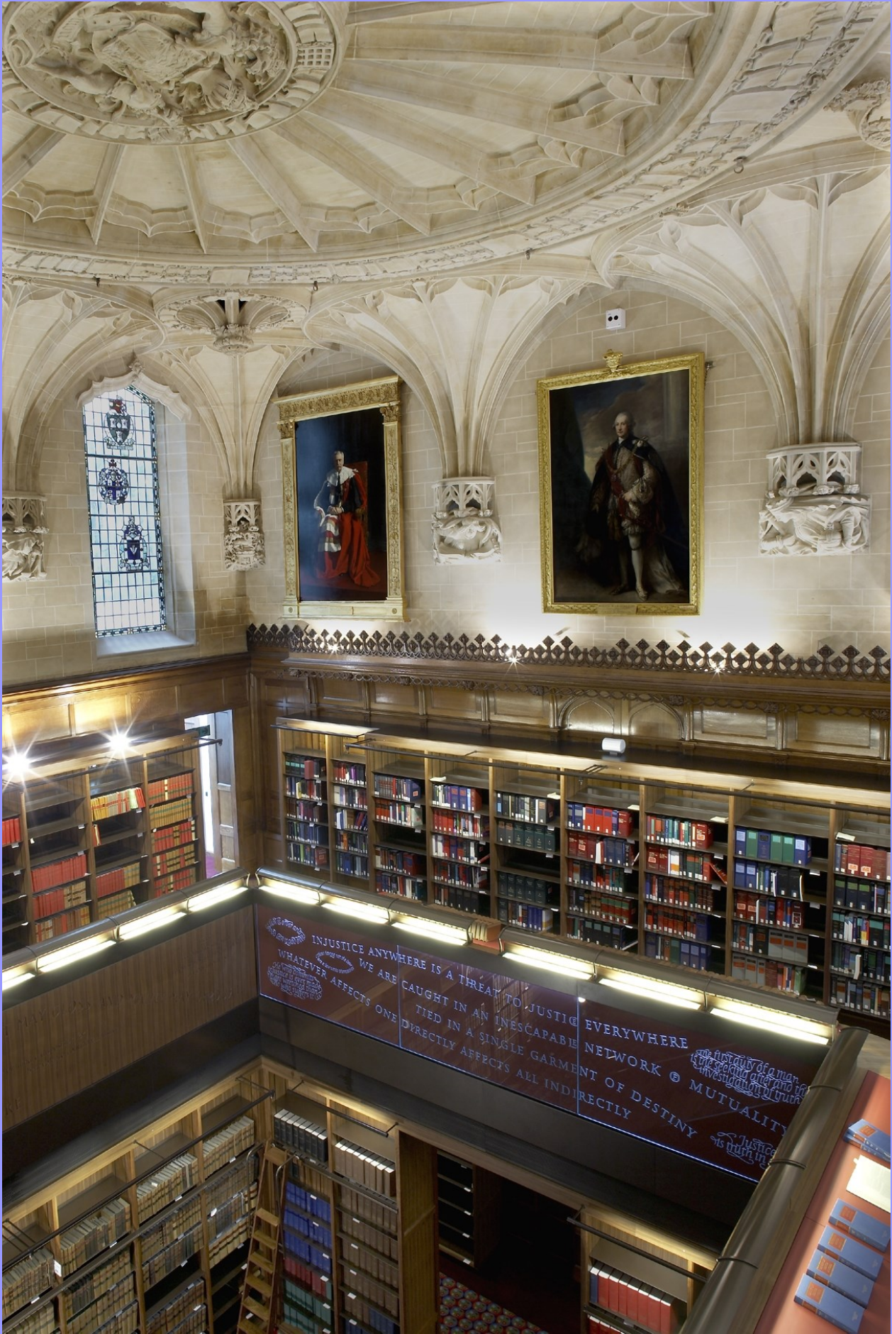
Supreme Court Library