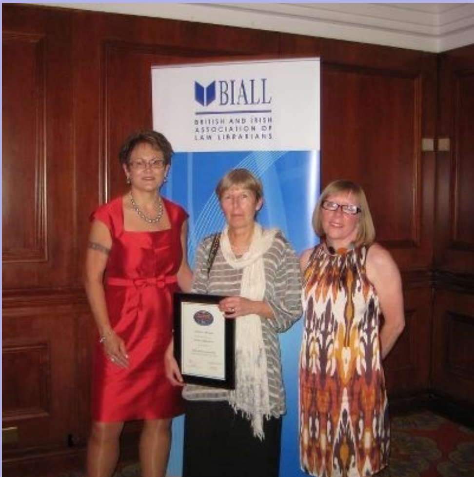
The Librarian and Deputy Librarian receive the award from the President of BIALL

The Wallace Breem Memorial Award 2012 was awarded to the staff of the Inner Temple Library. The Librarian and Deputy Librarian received the award at the Annual Conference dinner of the British and Irish Association of Law Librarians (BIALL), which took place at the Europa Hotel, Belfast on Friday 15th June. The award was made in recognition of our “considerable contribution to the legal information profession via three sources in particular.” These are Transcripts of Judicial Proceedings in England and Wales: a Guide to Sources, the daily Current Awareness blog and the AccessToLaw legal gateway site. Our nomination for the award was considered by an award panel, which endorsed the statement that “the quality of the work that [we] do, under considerable budgetary constraints, deserves an accolade”. This was the first time since its inception in 1992 that the award has been made to a library rather than to an individual librarian.