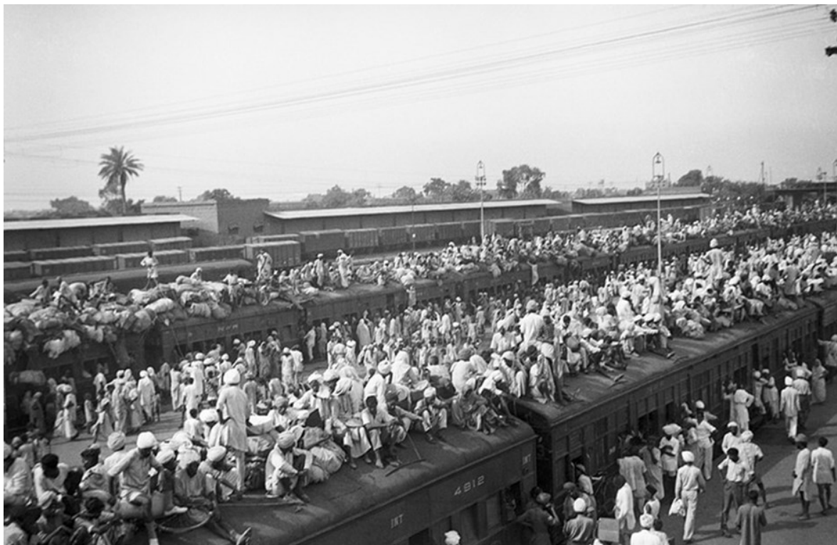
A train crammed with refugees leaves for Pakistan from the border city of Amritsar in 1947