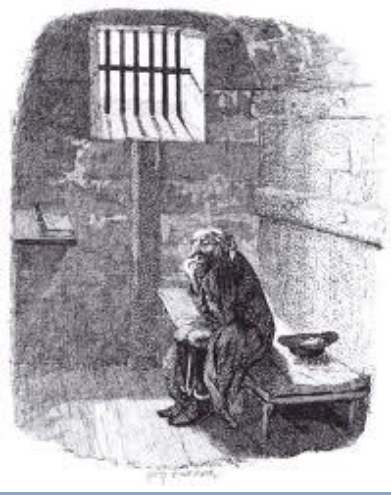
Fagin in Newgate Gaol,