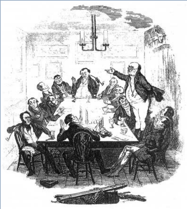
The Pickwick Club, Pickwick Papers

This theme is continued in his fiction, In Martin Chuzzlewit he described Tom Pinch's feelings upon entering the Inns thus: