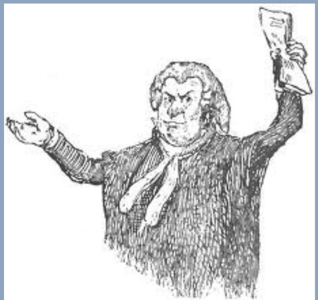
Serjeant Buzfuz, Pickwick Papers

Through the case of Bardell v Pickwick , Dickens gives us valuable insights in to the procedure of the common law courts, equity, debtors, ‘bails’, and the colourful characters that made their living through the law and those that made their living on the edges of the law and the legal system. Along with Bleak House and other works of Dickens, Pickwick Papers stands as a valuable guide to the legal system of his time and of Dickens', and many of his readers', opinion of it.